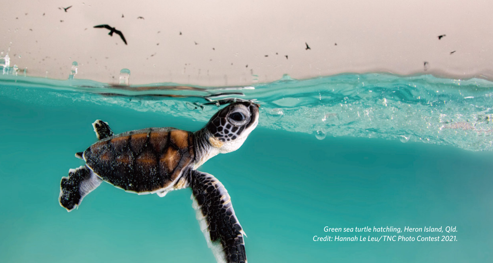
Green sea turtle hatchling, Heron Island, Qld.